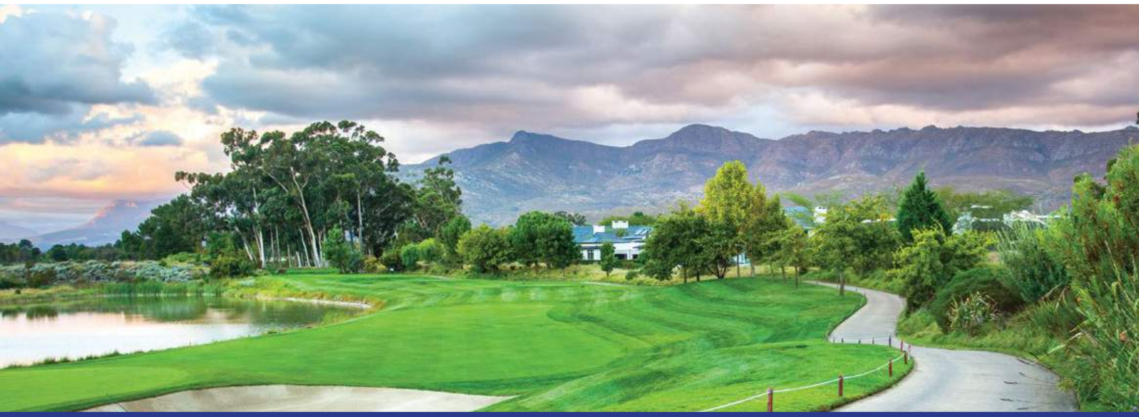
PEARL VALLEY GOLF COURSE

THE BLUE TRAIN A WINDOW TO THE SOUL OF AFRICA