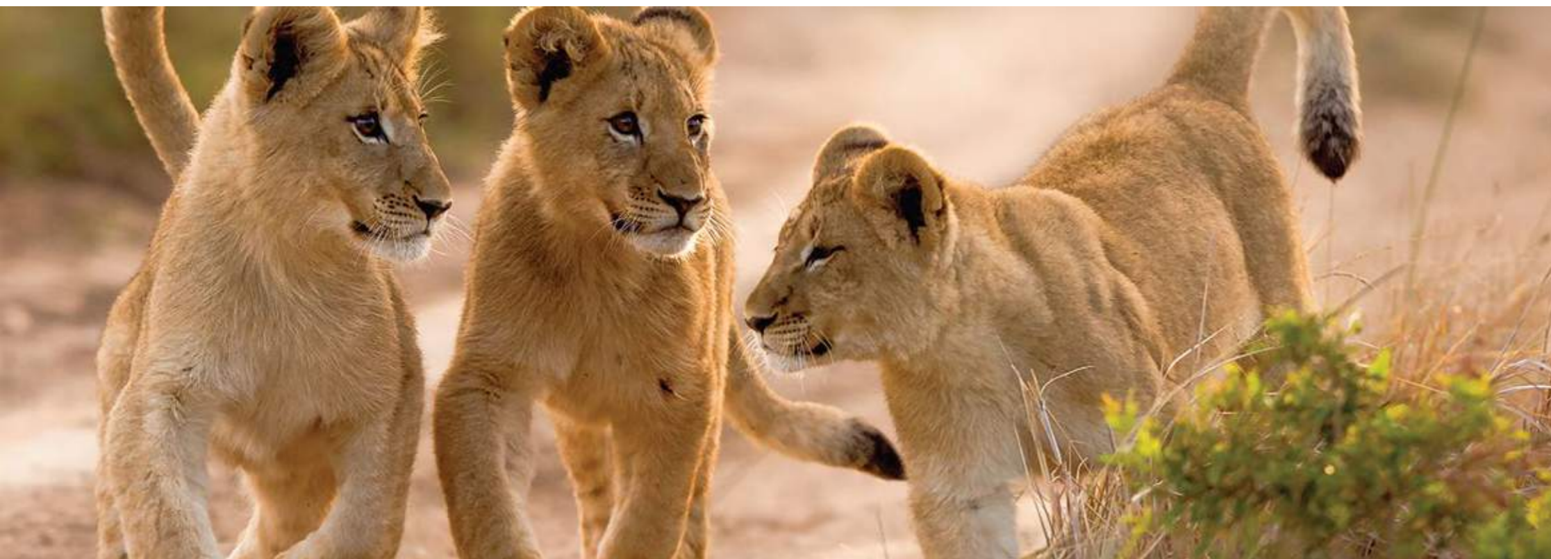
SHAMWARI GAME RESERVE

THE BLUE TRAIN A WINDOW TO THE SOUL OF AFRICA