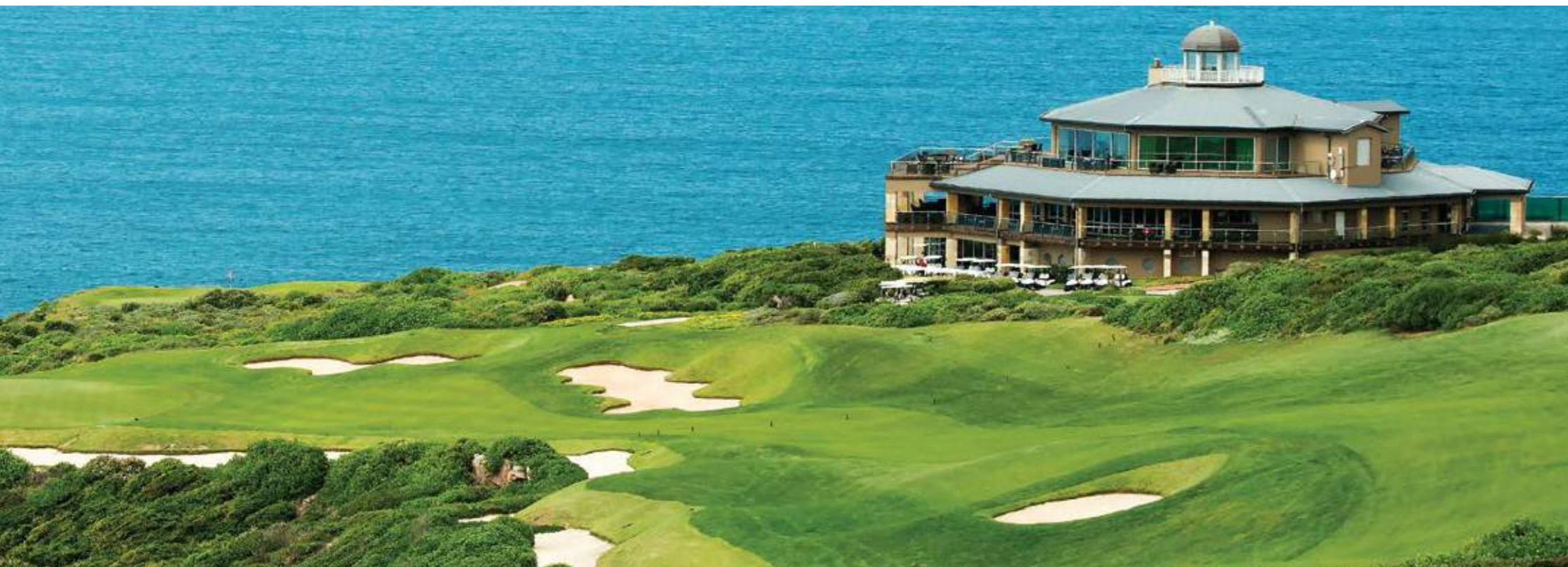
PINNACLE POINT GOLF COURSE

THE BLUE TRAIN A WINDOW TO THE SOUL OF AFRICA