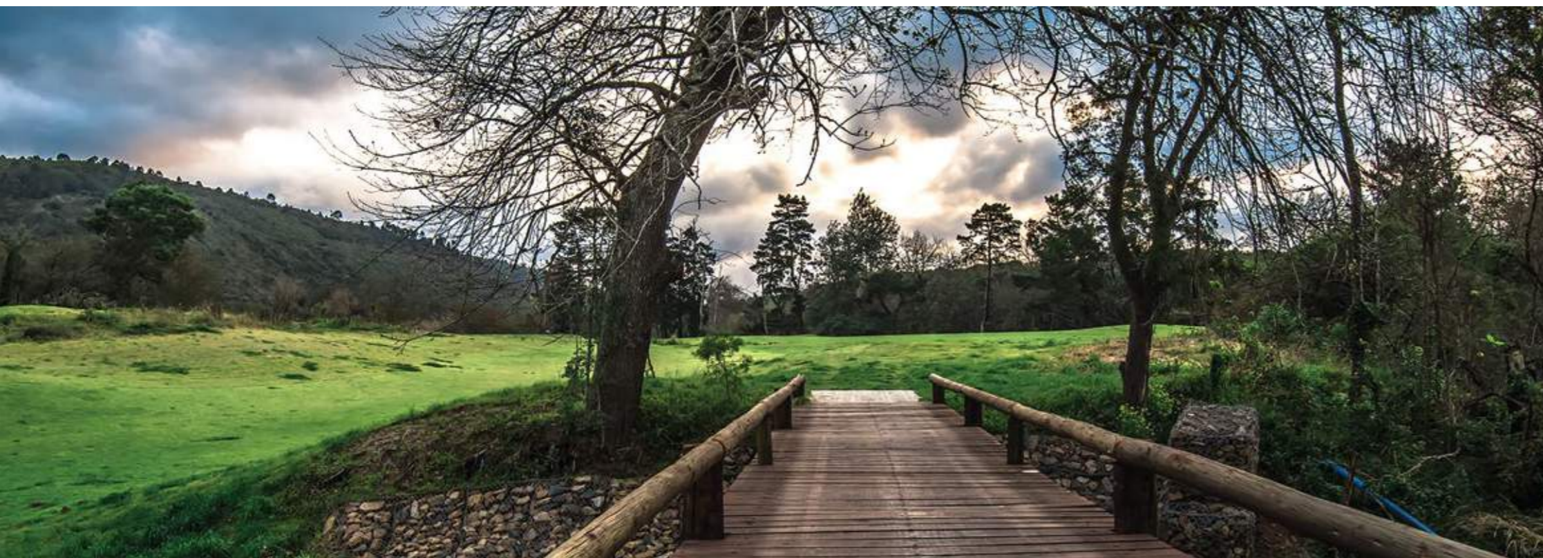
BELMONT GOLF COURSE

THE BLUE TRAIN A WINDOW TO THE SOUL OF AFRICA