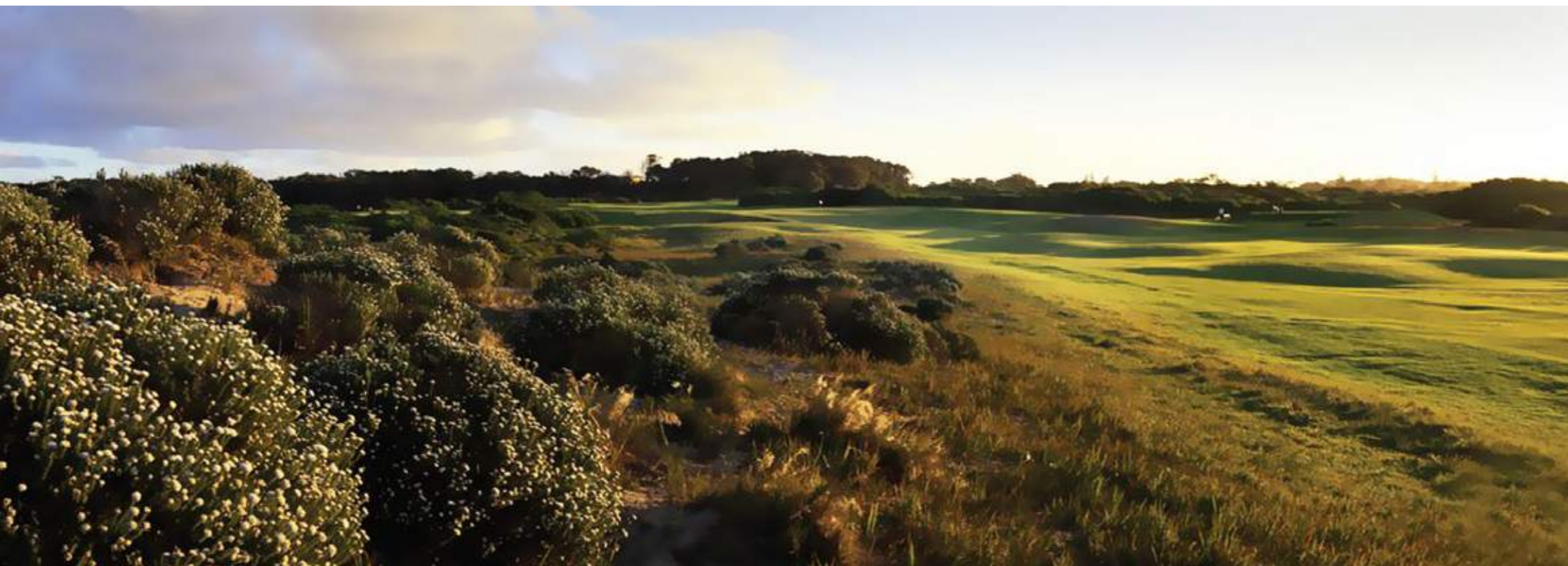
HUMEWOOD GOLF COURSE

THE BLUE TRAIN A WINDOW TO THE SOUL OF AFRICA